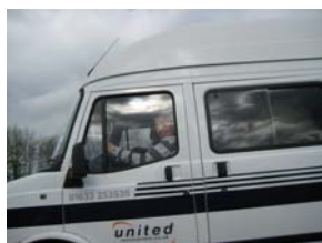
Above: The Boxster enjoying his front seat drive to Exeter recently.

We are very pleased to report that the clubs travel fund has now really taken off with money coming in regularly now to help fund our costly travelling expenses. The Car boot sale, match day raffles and the sponsored 50 laps have all raised much need funds and you the riders will benefit from this with cheaper travel through the year.