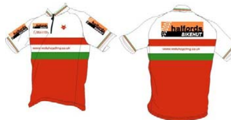
Obviously with long sleeves

large crowd will be here to witness the event. Entry to the championships will be open to Welsh riders and the entry forms will probably be out late August. All top Welsh riders will be here as the date allocated for the event was kept free by British cycling so as to keep league fixtures open allowing all riders to attend. ENCSC are very proud to stage this and have planned a day to remember and this news gets the ball rolling nicely.